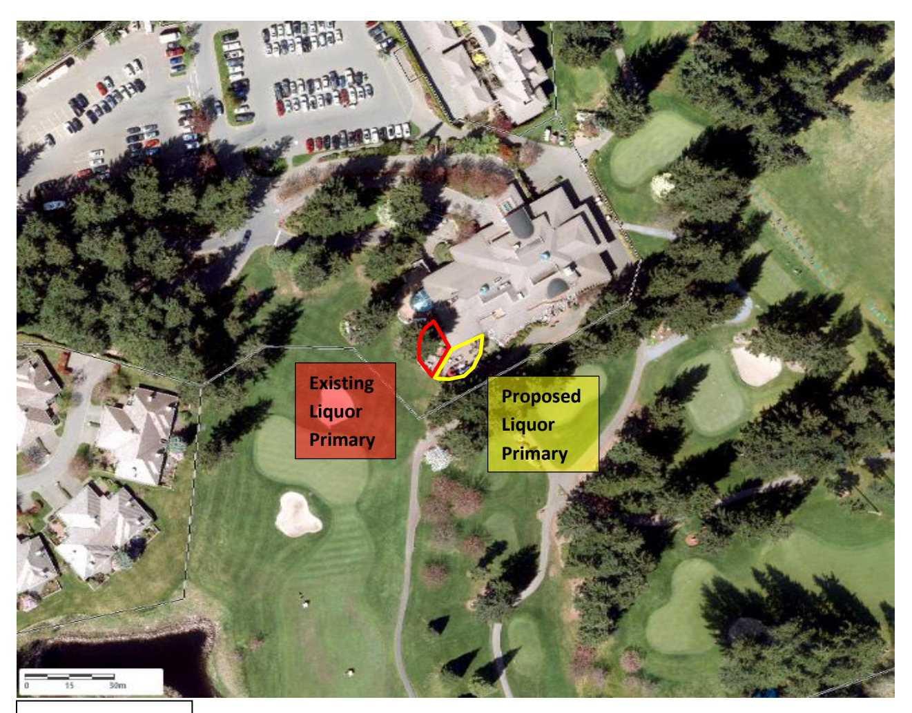
Figure 1. Context